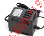
AC24V/3A Power Supply